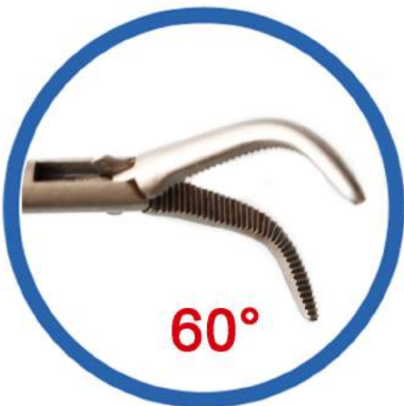
Mixer Dissecting Forceps AED116703