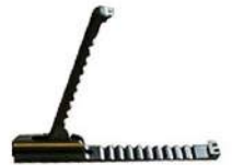
Retraction Grasper - Single Action