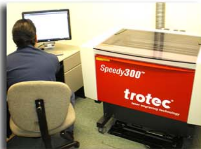
Precision Laser Markings