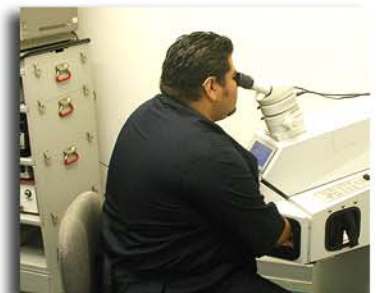
Precision Laser Welding