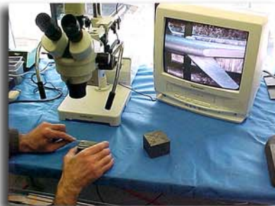
1.0 mm Micro Jaw Replacement