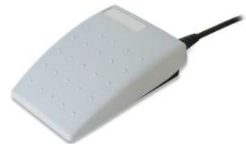
Foot pedal (optional)